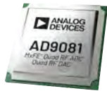
RF Data Converters Integrated & high performance