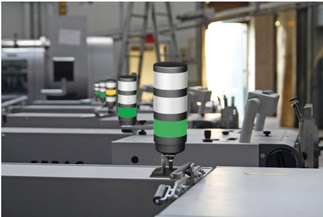
Wireless tower lights allow users to track trends in machine run time and cycle time.

With a wireless system, users can remotely monitor machines in a central point to log information. For example, using a tower light with a wireless radio base offers not only local indication of machine status but can also provide remote status of each light module. By logging results from machine status indicators like tower lights, users can track trends in individual machine up time and cycle counts, giving operators machine status updates when and where it is needed. Capturing machine status helps users determine when repairs are needed and make decisions about new machine investments. This system provides the information necessary to react quickly to system changes and drive efficiency improvements based on data that was previously unavailable.